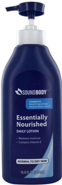
HBF-10 NBE Compare to Nivea Original Daily Moisture Body Lotion (16.9 fl.oz/500mL)