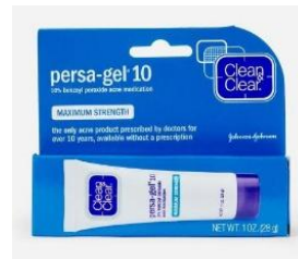
NBE Compare to Clean & Clear Persa-Gel 10 Acne Medication With Benzoyl Peroxide