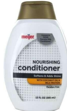
MJ883 NBE Compare to OGX Coconut Milk Conditioner (13fl.oz/385mL)