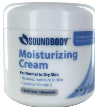
HBF-4 NBE Compare to CeraVe Moisturizing Cream (16 oz/453g)