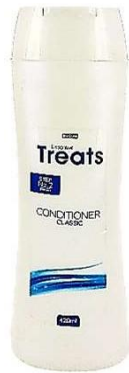
NBE Compare to Herbal Essences Moisturizing Conditioner (10.14 fl. oz/300mL)