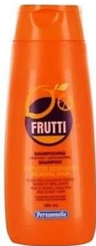
JC076 NBE Compare to Garnier Fructis Normal Hair Shampoo (13 fl oz/384 mL)