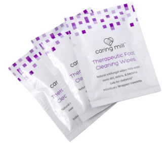
NBE Compare to Caring Mill Therapeutic Antifungal Foot Wipes