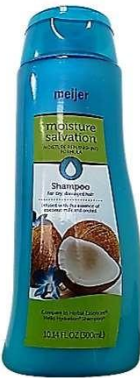
NBE Compare to Herbal Essences Moisturizing Shampoo (10.14 fl. oz/300mL)