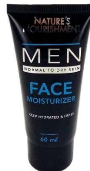
DC886 NBE Compare to Natures Nourishment Men's Normal to Dry Skin (2 fl. oz/60mL)