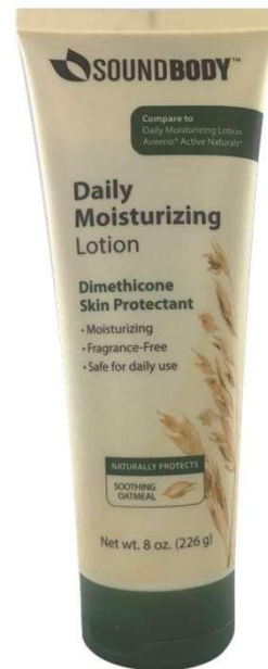
HBF-3 NBE Compare to Aveeno Active Naturals – Daily Moisturizing Lotion (8oz/226g)