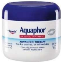
NBE Compare to Aquaphor Healing Ointment Advanced Therapy (3.5 fl oz/99 mL)