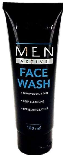
DC637 NBE Compare to Natures Nourishment Men's Face Wash Cleanses and Refreshes (4.1 fl. oz/120mL)