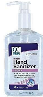
NBE Compare to Purell Instant Hand Sanitizer Original (8 fl oz/236mL)