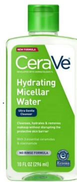
NBE Compare to CeraVe Hydrating Micellar Water Facial Cleanser & Eye Makeup Remover (10 fl oz/300mL)