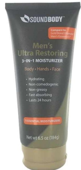
HBF-13 NBE Compare to Gold Bond Ultimate Men's Essentials (6.5oz/184g)