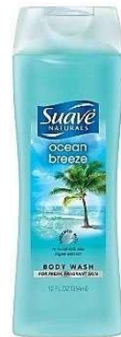
NBE Compare to Suave Naturals Ocean Breeze Body Wash (12 fl. oz/354 mL)