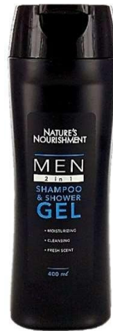
DC889 NBE Compare to Natures Nourishment Men's Shampoo & Shower Gel (13.5 fl. oz/400mL)