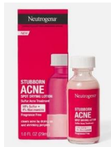
NBE Compare to Neutrogena stubborn acne spot drying lotion - 1 fl oz