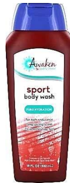
NBE Compare to Old Spice Men's Pure Sport Body Wash (18 fl oz/532ml)