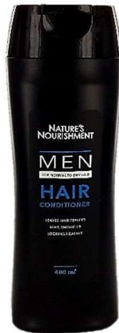
DC888 NBE Compare to Natures Nourishment Men's Conditioner (13.5 fl. oz/400mL)