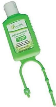
QC99521 NBE Compare to Purell Instant Hand Sanitizer (2 fl oz/59mL)