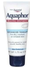
NBE Compare to Aquaphor Healing Ointment Advanced Therapy (1.75 fl oz/50mL)