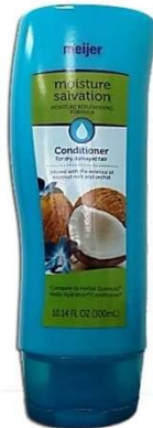
NBE Compare to Herbal Essences Moisturizing Conditioner (10.14 fl. oz/300mL)