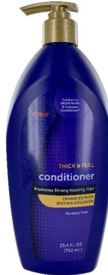
MJ767 NBE Compare to OGX Biotin and Collagen Shampoo (25.4 fl.oz/750mL)