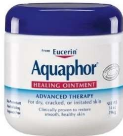
NBE Compare to Aquaphor Healing Ointment Advanced Therapy (14 fl oz/396mL)