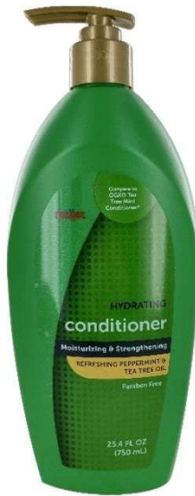
MJ753 NBE Compare to OGX Tea Tree Mint Conditioner (25.4 fl.oz/750mL)