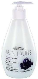
DC352 Skin Fruits Liquid Hand Soap Tropical Medley (15 fl oz/444 mL)