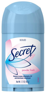
NBE Compare to Secret Powder Fresh Wide Solid Antiperspirant and Deodorant, (1.7 oz/50ml)