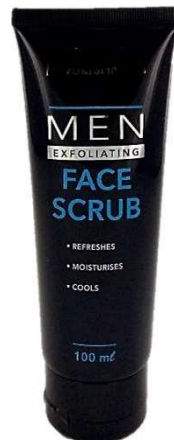
DC639 NBE Compare to Natures Nourishment Men's Face Scrub Cleanses and Refreshes (3.4 fl. oz/100mL)