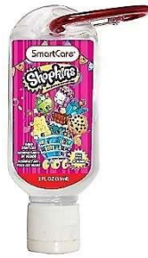
Hand Sanitizer Original Scent (2 fl oz/59 mL)