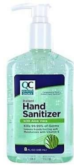
NBE Compare to Purell Instant Hand Sanitizer Aloe Vera (8 fl oz/236mL)