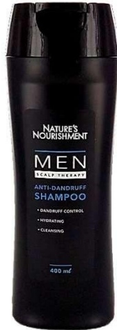
DC887 NBE Compare to Natures Nourishment Men's Shampoo (13.5 fl. oz/400mL)