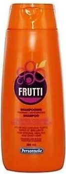
JC074 NBE Compare to Garnier Fructis Color Shield Shampoo (13 fl oz/384 mL)