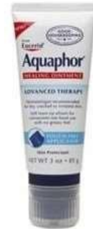
NBE Compare to Aquaphor Healing Ointment Advanced Therapy (3 fl oz/83mL)