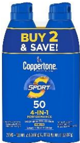
NBE Compare to Coppertone Sport Sunscreen Spray - SPF 50 - 11oz - Twin Pack