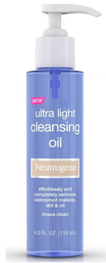
NBE Compare to Neutrogena Ultra Light Face Cleansing Oil & Makeup Remover (4 fl. oz/120mL)