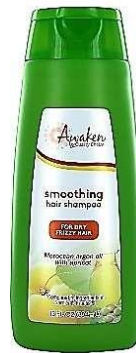
NBE Compare to Garnier Fructis Daily Care Hair Shampoo (13 fl oz/384 mL)