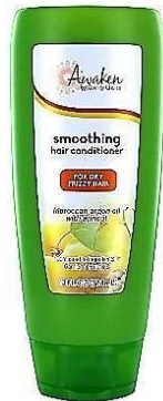
NBE Compare to Garnier Fructis Daily Care Hair Conditioner (13 fl oz/384 mL)