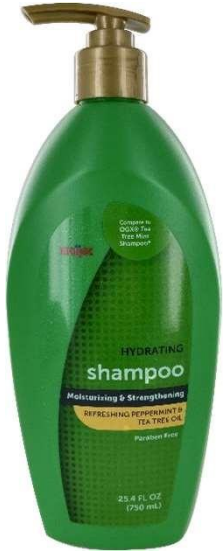
MJ772 NBE Compare to OGX Tea Tree Mint Shampoo (25.4 fl.oz/750mL)