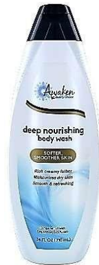
NBE Compare to Dove Deep Moisture Nourishing Body Wash (24 fl oz /710mL)